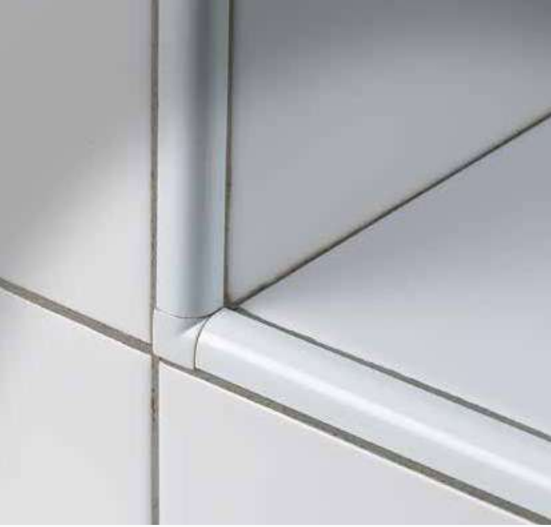
Wall detail of an internal corner joint between ROUNDJOLLY trim profiles and ROUNDcapsule endcap.