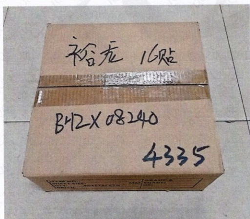
Photo of Samples